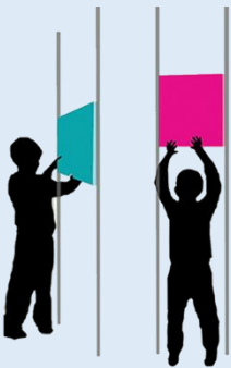
3. Install canvases on frames