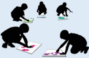
2. Paintings on various subjects